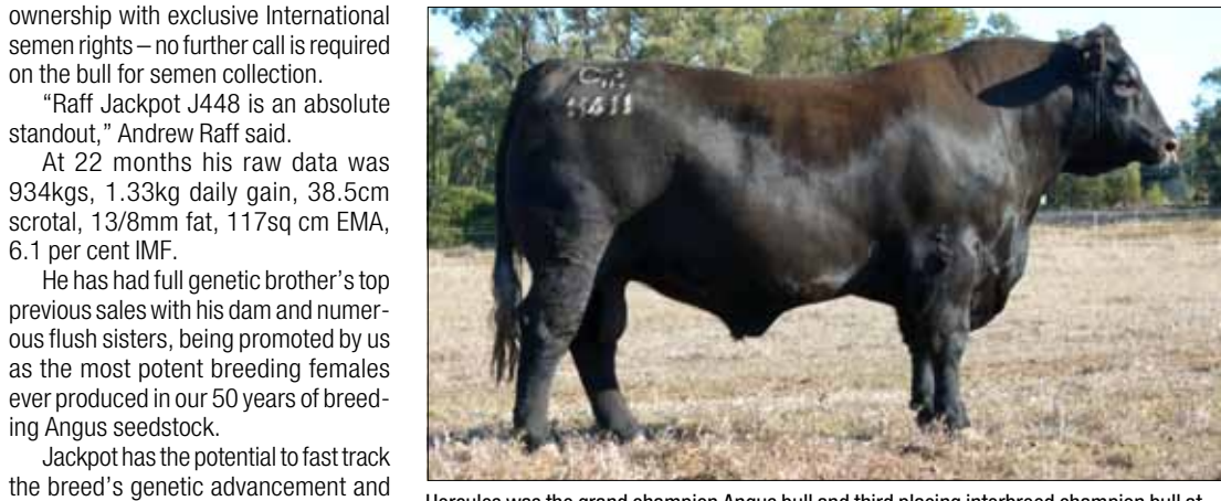
Hercules was the grand champion Angus bull and third placing interbreed champion bull at this year's Beef Australia event in Rockhampton